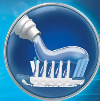
STEP 2 Hydrogen peroxide whitening gel

Crest ® PRO-HEALTH ™ [HD] ™ is a daily toothpaste and gel system that provides your patients with an exhilarating clean that they will have to try to believe.