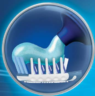
STEP 1 Stannous fluoride antibacterial toothpaste

As effective as chlorhexidine on gums,* with the advantage of noticeable whitening †